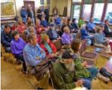
A capacity crowd fills the Port Orford Public Library Freedom of Speech Room.